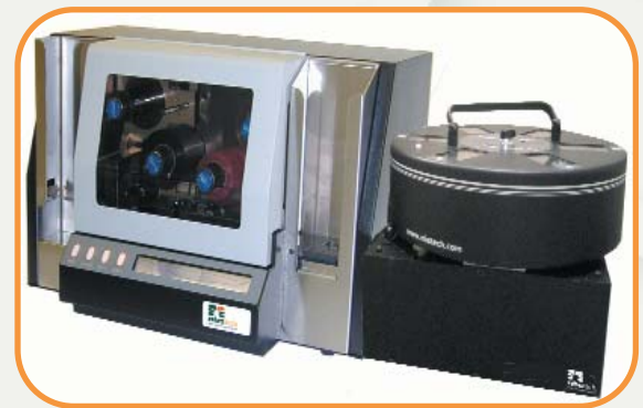
Optional 6-hopper carousel